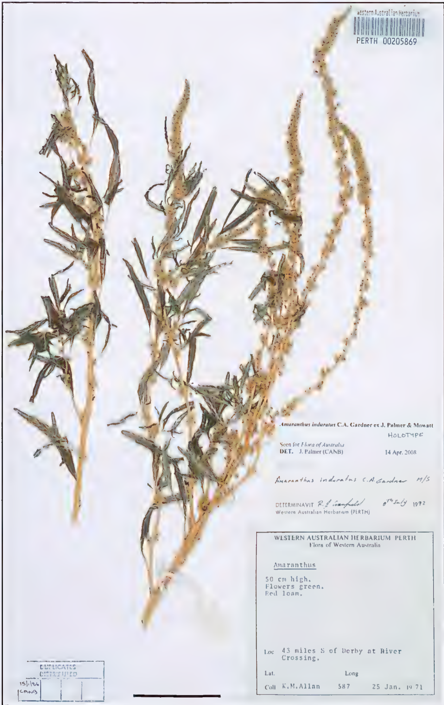
Figure 4. Holotype of Amaranthus induratus (K.M. Allan 587, PERTH), scale = 5 cm.